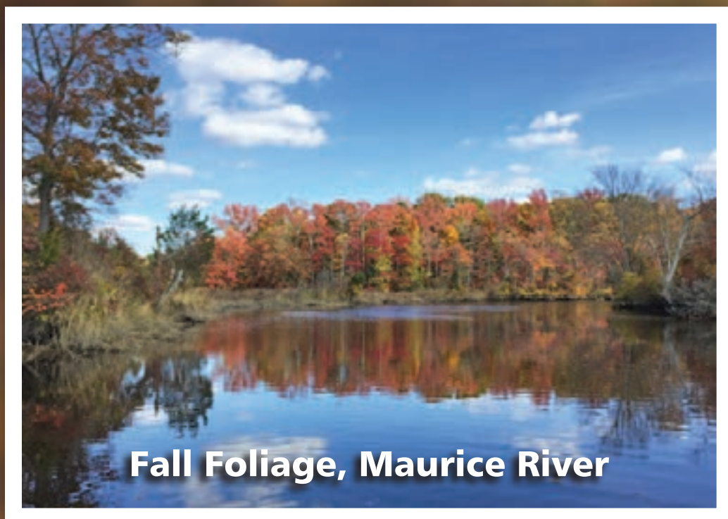
Fall Foliage, Maurice River