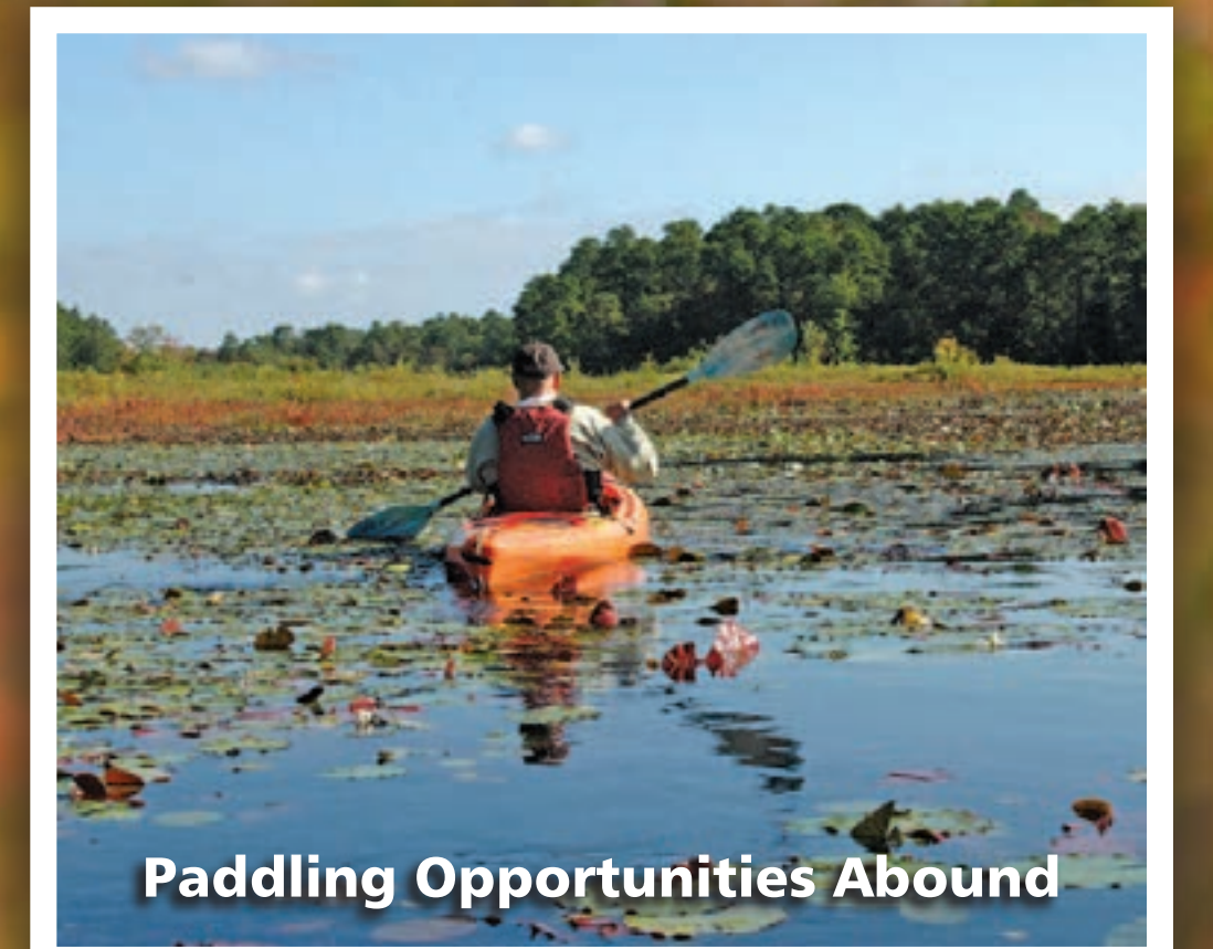
Paddling Opportunities Abound