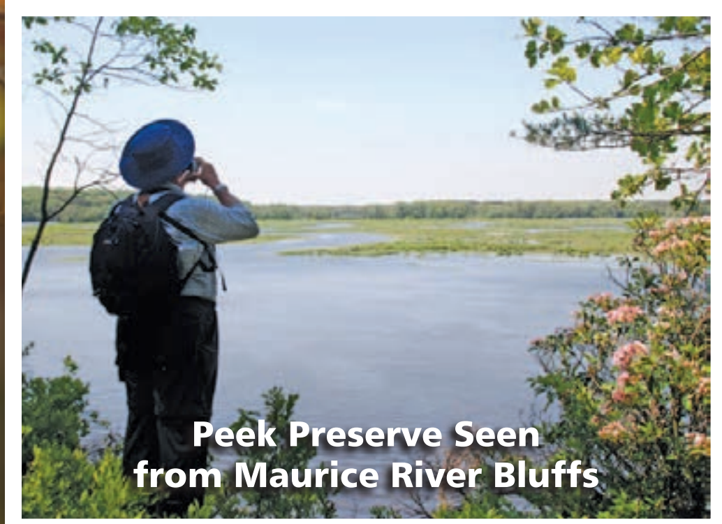
Peek Preserve Seen from Maurice River Bluffs