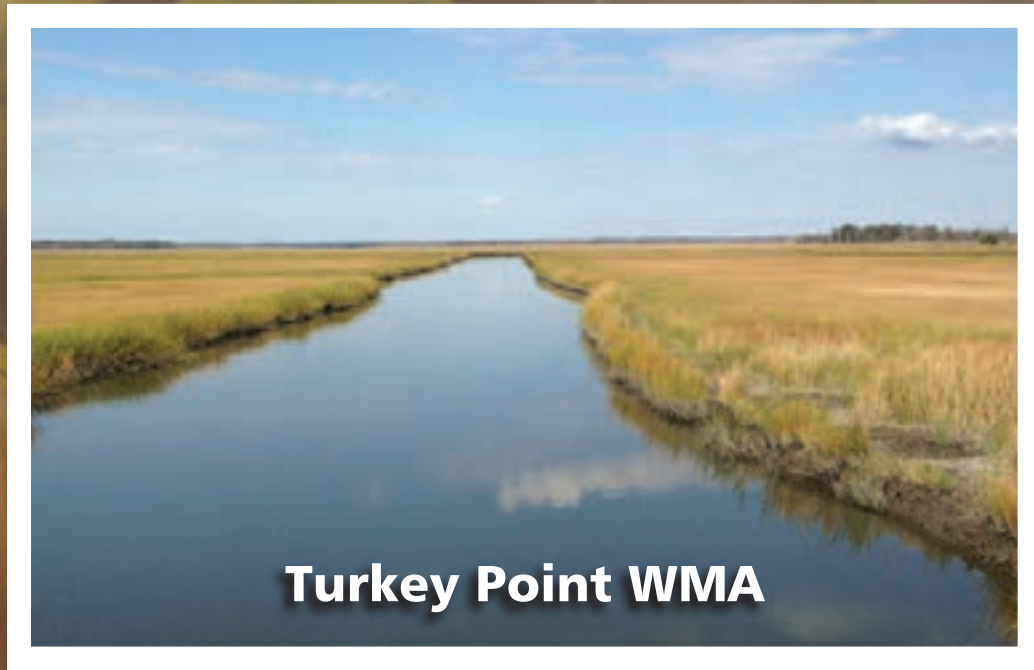
Turkey Point WMA