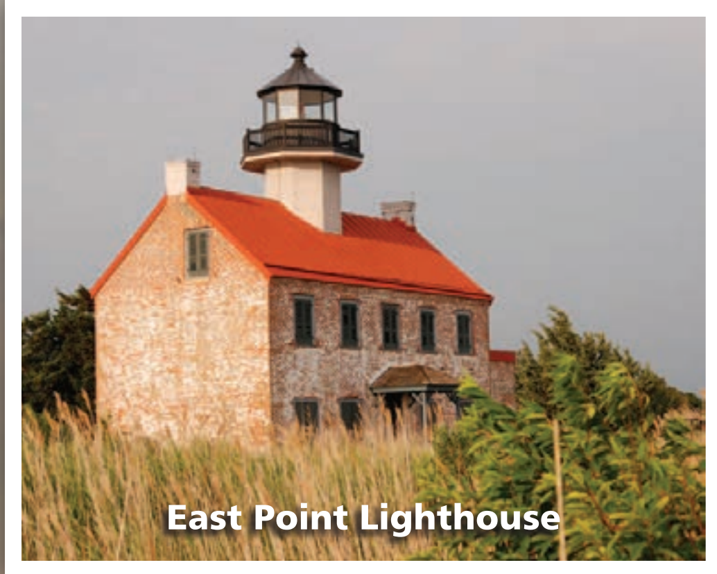
East Point Lighthouse

The wayside exhibits along the WheatonArts Trail offer some insights into the natural world. Each sign also lists ways you can help support plants and animals in order to enhance their welfare as well as protect our environment. The trail offers samples of some of our region's natural environments and their inhabitants. We hope the trail will act as a springboard, enticing you to expand your visit for a weekend or to enjoy our region's many natural areas for a lifetime. The map below shows the rich variety of nearby public lands that you can explore.