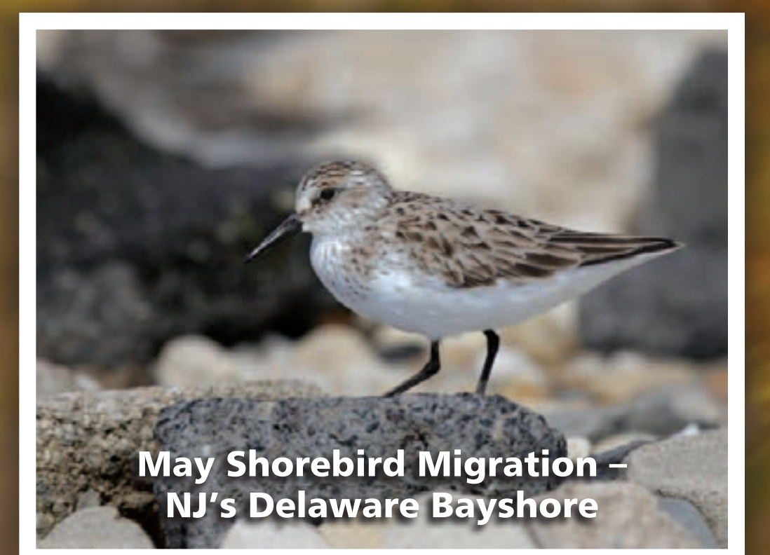
May Shorebird Migration - NJ's Delaware Bayshore