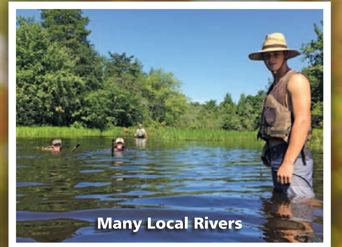
Many Local Rivers