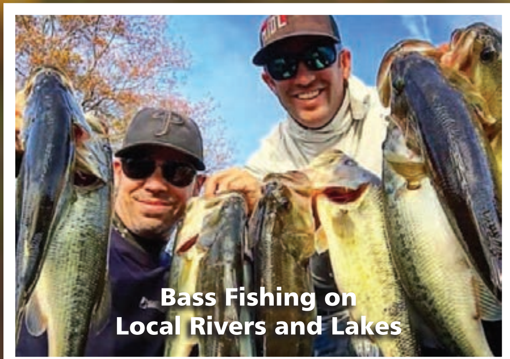
Bass Fishing on Local Rivers and Lakes