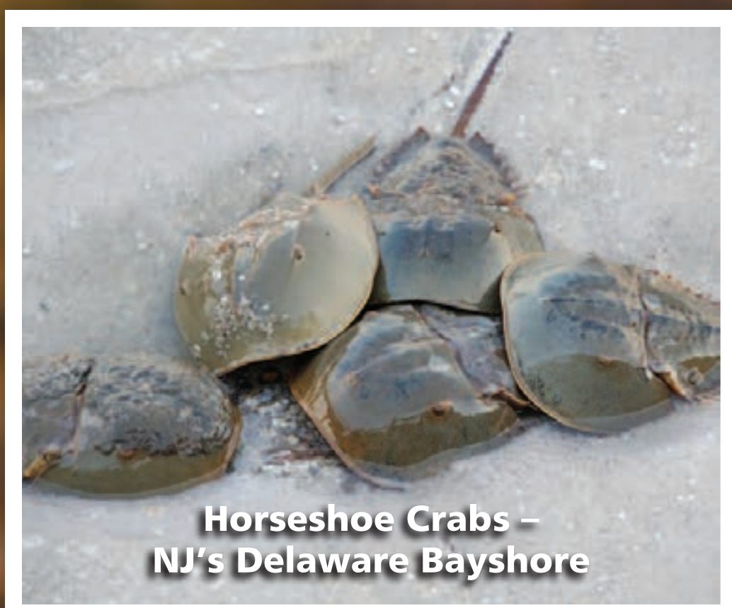
Horseshoe Crabs - NJ's Delaware Bayshore