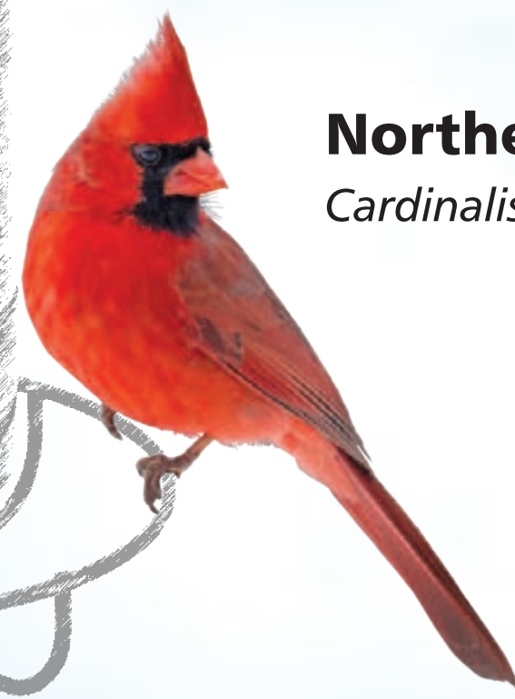
Northern Cardinal Cardinalis cardinalis