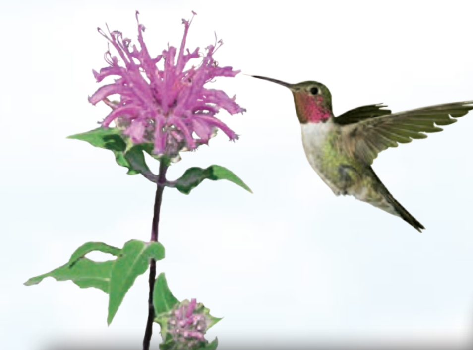
Ruby-throated Hummingbird Archilochus colubris Feeding on native flora — Monarda fistulosa