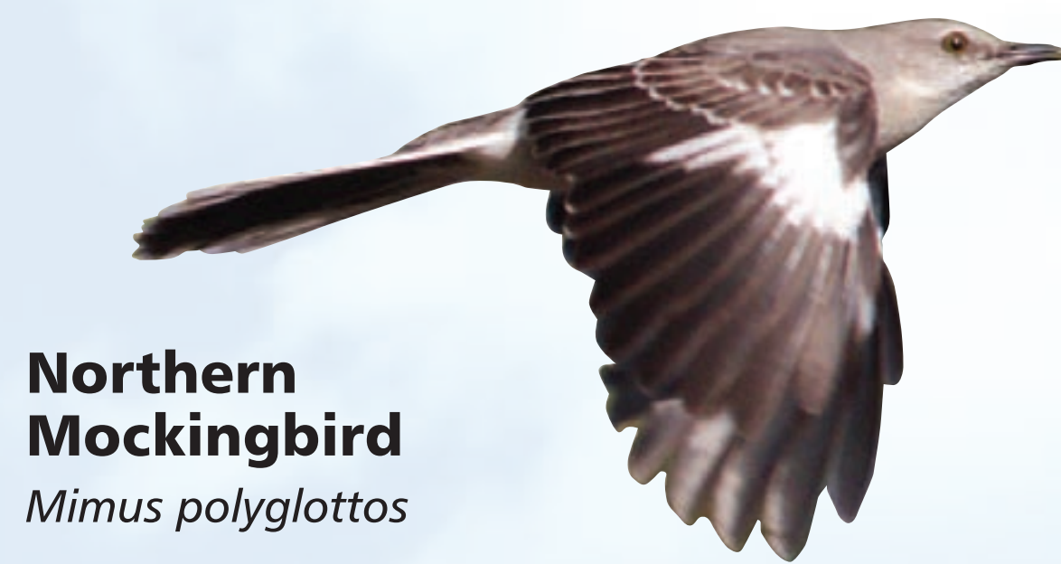
Northern Mockingbird Mimus polyglottos