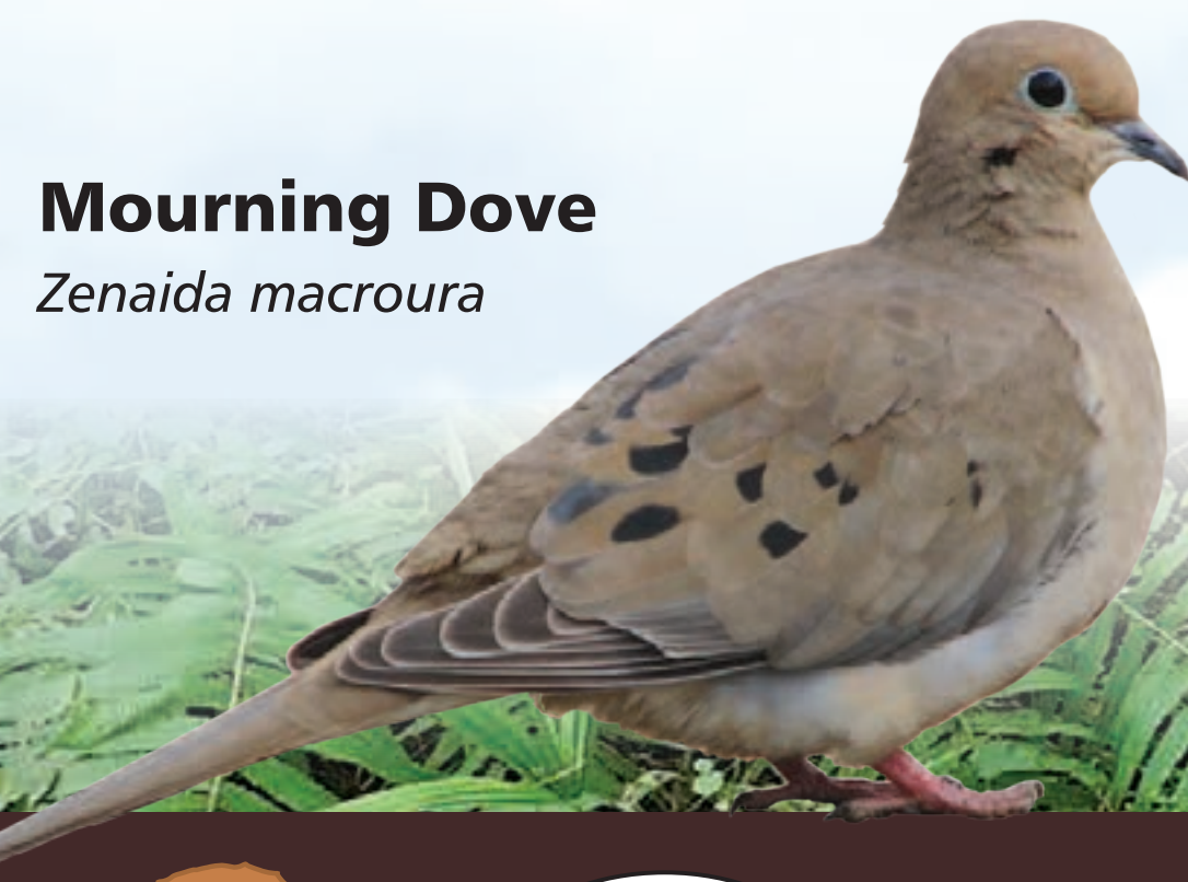
Mourning Dove Zenaida macroura