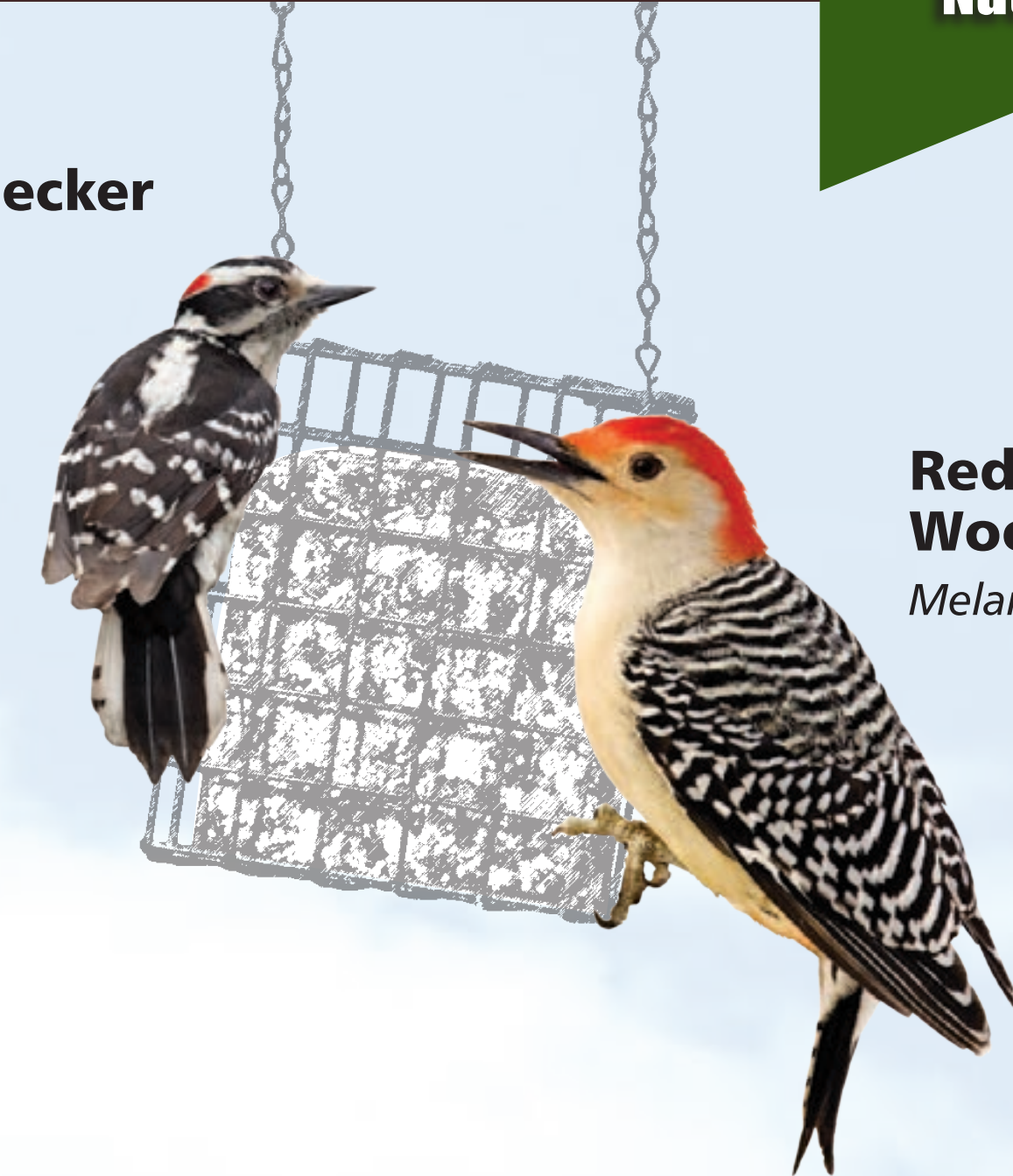
Downy Woodpecker Picoides pubescens

Placing small piles of branches or a discarded Christmas tree at the base of your feeding station will give birds a place to escape predators.