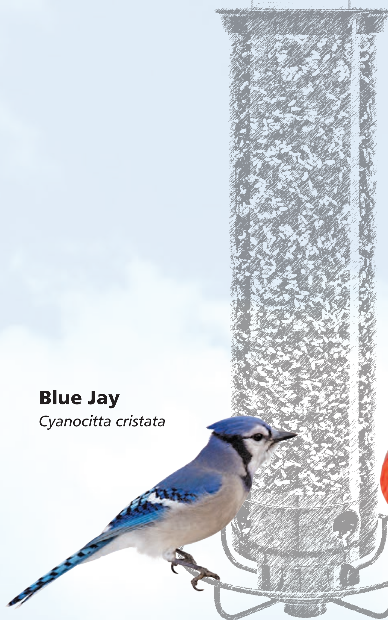
Blue Jay Cyanocitta cristata

Bird feeding stations have long contributed to an appreciation of nature, often sparking a lifelong interest in wildlife stewardship. For many people their first introduction to the natural world is in their own backyard, observing creatures going about their daily lives. While birds eat berries and seeds, it's important to recognize that insects, e.g. caterpillars, ants, and beetles, are just as crucial to their survival. Butterflies rely on nectar sources, and their caterpillars depend on specific food plants, so having the right native plants is vital to their survival.