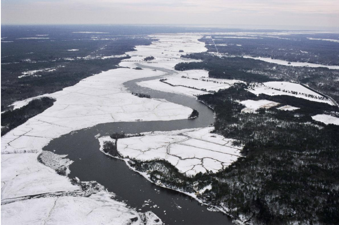
Snow in 2010 Maurice River Foreground TNC Bluffs Preserve