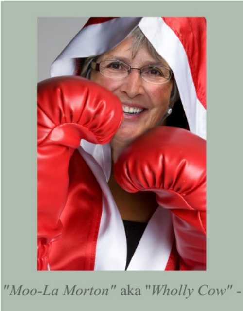
"Moo-La Morton" aka "Wholly Cow" -

We challenge you to Beat the Chump; you know - Moolah Morton. Sending renewal reminders is always less green, along with being time-consuming and costly. So if you Beat the Chump by sending in your dues before she writes to you, we will be able to spend more time and funds on planning and refining our programs. Use this link for credit card payments, or for those who prefer check writing – CU Maurice River, PO Box 474, Millville, NJ 08332. The only thing you'll miss out on are her quirky renewal letters, but maybe that's a blessing?