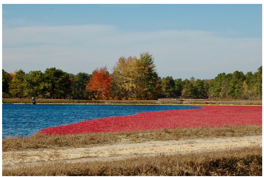
Flooded cranberry bog in Burlington Clounty.