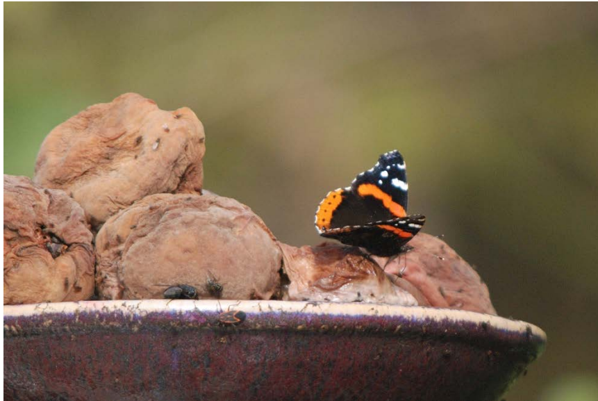
This red admiral is enjoying a rotten peach on a butterfly feeder dish. "Adult butterflies rarely nectar but prefer fermented fruit, sap and bird droppings." (Burger/Gochfeld).

There are two broods in the northern part of their US range. Overwintering adults can live six months or more, but are mostly dormant in winter. Adults emerging in June-July generally live only a few weeks. The later brood will migrate south and winter over as an adult. In the southern part of their range there are as many as four generations (Scott 1984). A few winter over here in southern NJ, probably in cervices, woodpiles, and such.