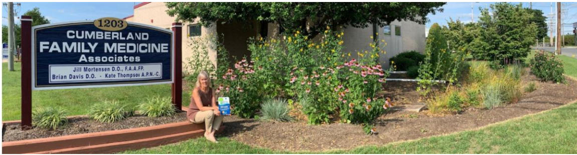
Project #1 Cumberland Family Medicine: Gallons of stormwater saved per year - 66,016 Pounds of pollution kept out of aquatic habitats per year - 11.69

a threat not only to the watershed's community health and sustainability, but also its environmental integrity. In response to this threat to the Wild and Scenic Maurice River's outstanding natural values, over the last two years, CU has installed four demonstration rain and pollinator garden systems. These types of projects help reduce further water waste and contamination stemming from stormwater runoff.