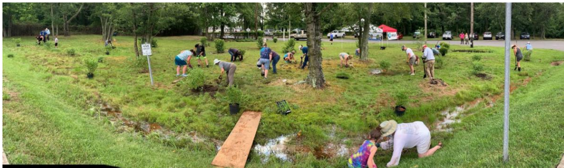
Project #2 Amcor Rigid Packaging: Gallons of stormwater saved per year - 166,491 Pounds of pollution kept out of aquatic habitats per year - 30

Millville, the Maurice River Watershed's second most populated urban area, also has some of the watershed's highest concentrations of impervious surface coverage (ranging between 15-25%), according to Environment America's Threats to the Delaware River Basin Interactive Map. By disconnecting water from stormwater systems and promoting percolation into the ground, the drinking water source can be replenished with clean fresh water. Meanwhile, aquatic habitats are protected from contamination, as well as from shrinkage and/or changes in flow regimes caused by groundwater depletion. While continued efforts to end over-consumption of water are of great importance, eco-friendly stormwater management goes a long way toward curbing water waste.