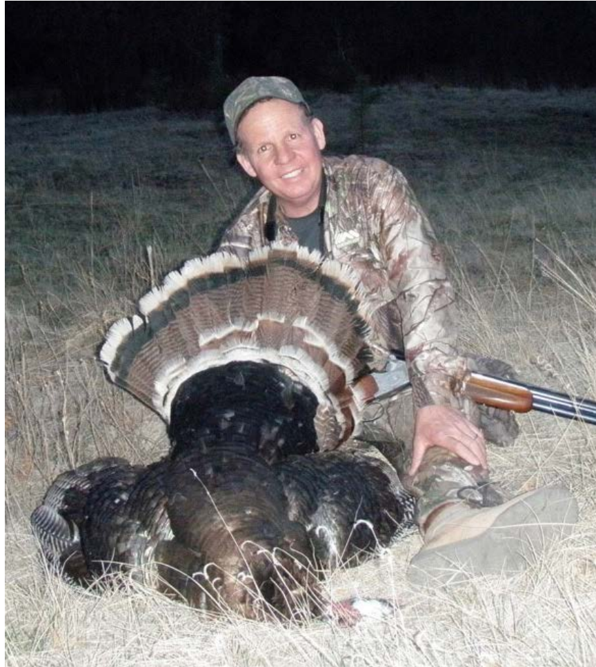
Author's husband shows off the tail of a Merriam's turkey in New Mexico. Note the very bright buffy halo.

comparison. The final band of color on the fanned tail is a buff to white color and broader than the Eastern bird's tail band. When the Merriam's gobbler displays, the band creates a very bright halo effect.