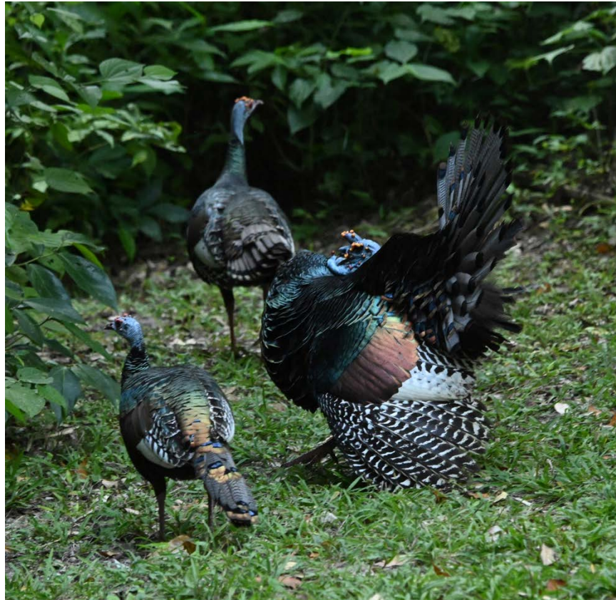
Photographed by the author in Belize, this Ocellated tom struts hen birds in hopes of mating.

At Gallon Jug we stayed at Chan Chich in a cottage with wooden slatted blinds for windows. Each morning the Ocellated turkeys woke us with their nasal grunts and puts, plus sounds like a soft domestic goose's honk.