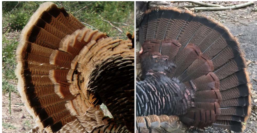
Comparison of the Rio Grande, left, versus Eastern tom's tail.

My fondest memory of Vermejo Park was of a very steep cliff with a narrow path that ran the length of the escarpment, for what I would estimate to be a few miles. Walking in a long row along it was a large group of bull elk, with racks easily 4-6 feet across. They were perched high above the desert floor in a death-defying conga line. Their majesty as they essentially tightrope-walked the cliff's face was breathtaking.