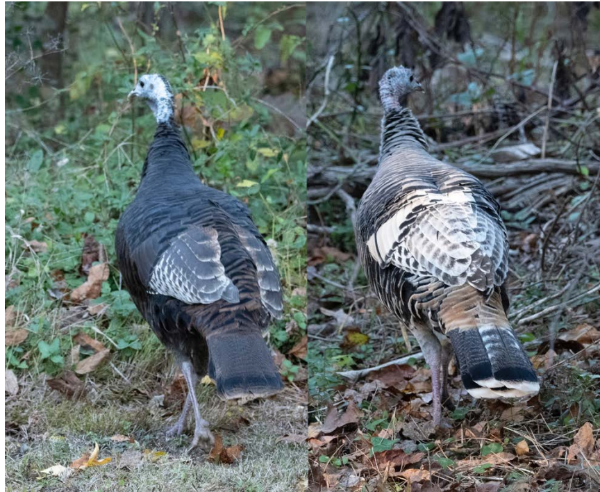
Both of these hens are Eastern turkeys– one is typical coloring, left, and the smoky gray morph, right.

by a recessive gene. One is in our neighborhood currently and she's a real beauty.