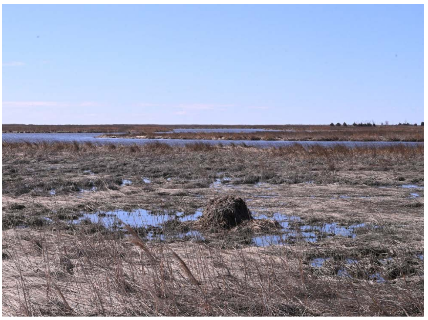
Lodges are referred to as push-ups- March.

After six consecutive failures of this last remaining pair of eagles, state biologists took an egg to Patuxent Wildlife Research Center for artificial incubation in 1989. A plaster egg was left in the nest as a placeholder. This pair, as well as many other top predator species, had thin egg shells from the contaminant DDT which had been retained in the female's reproductive system. When the chick hatched, the plaster egg was swapped out for the live young.