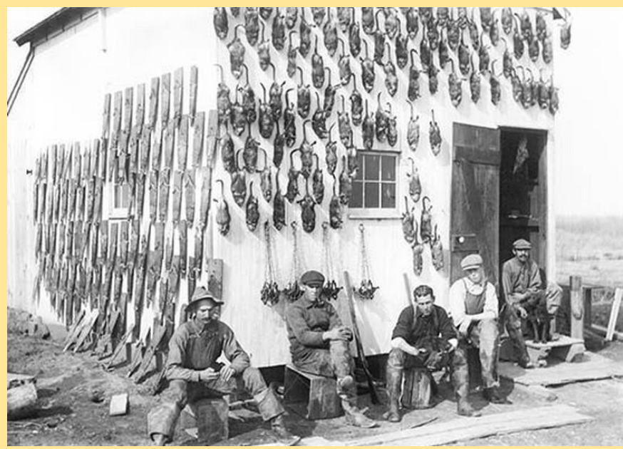
Trappers' shed in Southern NJ. Muskrats were trapped for both fur and meat.