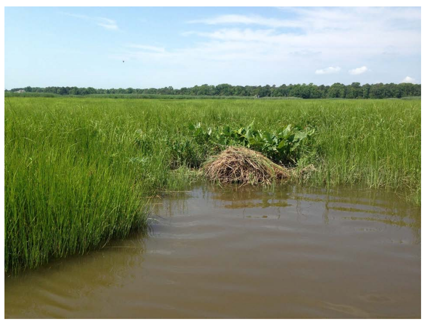
Muskrats build a lodge out of vegetation on the marsh plain. Entrances are watery channels accessed from beneath- July.