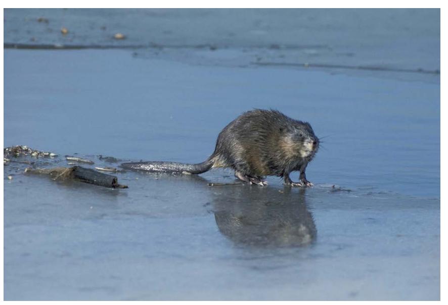
Muskrats are present in all the continental United States including Alaska, as well as in Canada, with

Habitat loss also plays a role in their decline. The persistent advancement of invasive phragmites across local marsh plains crowds them out of preferred marsh habitat. Furthermore, the loss of aquatic vegetation through erosion and herbivory by non-migratory geese depletes the grasses they need to hide from predators, build their lodges, and eat. Prior to year-round geese destroying the marsh plain by our home on the Maurice River, we used to see muskrats often in the watery guts. They were so plentiful that at one point they grazed on the grasses in our yard. But the geese tore out the wild rice by the roots, leaving the muskrats without food or shelter.