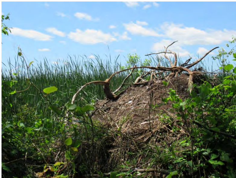
The root ball of a fallen tree where the chick was raised after its nest fell as evidenced by down.