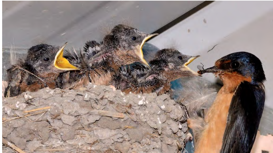
Adult feeds barn swallow chicks in mud nest built on carport rafter.

nest's wall. Then its cup is lined with feathers. They may return to the same mud-constructed nest in upcoming seasons. Nest building takes a lot of time and energy, so nests and their remnants should be left for future years.