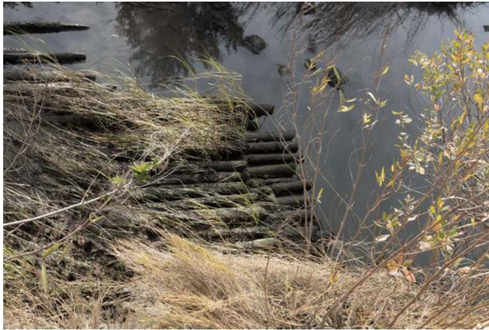
There's corduroy-type construction at the site of the old bridge, but you can no longer safely cross to the islands.