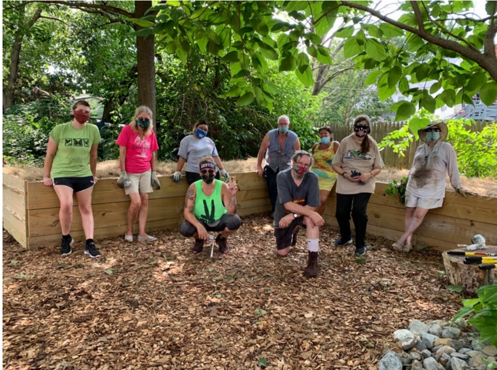
Volunteers incorporated aspects of the hügelkultur process when planting CU Maurice River's Neighborhood Garden in Millville.

the mound as well as providing a spongy material that can help to retain moisture towards the bottom of the pile. Over several years the mound will settle as the woody material continues to decay.