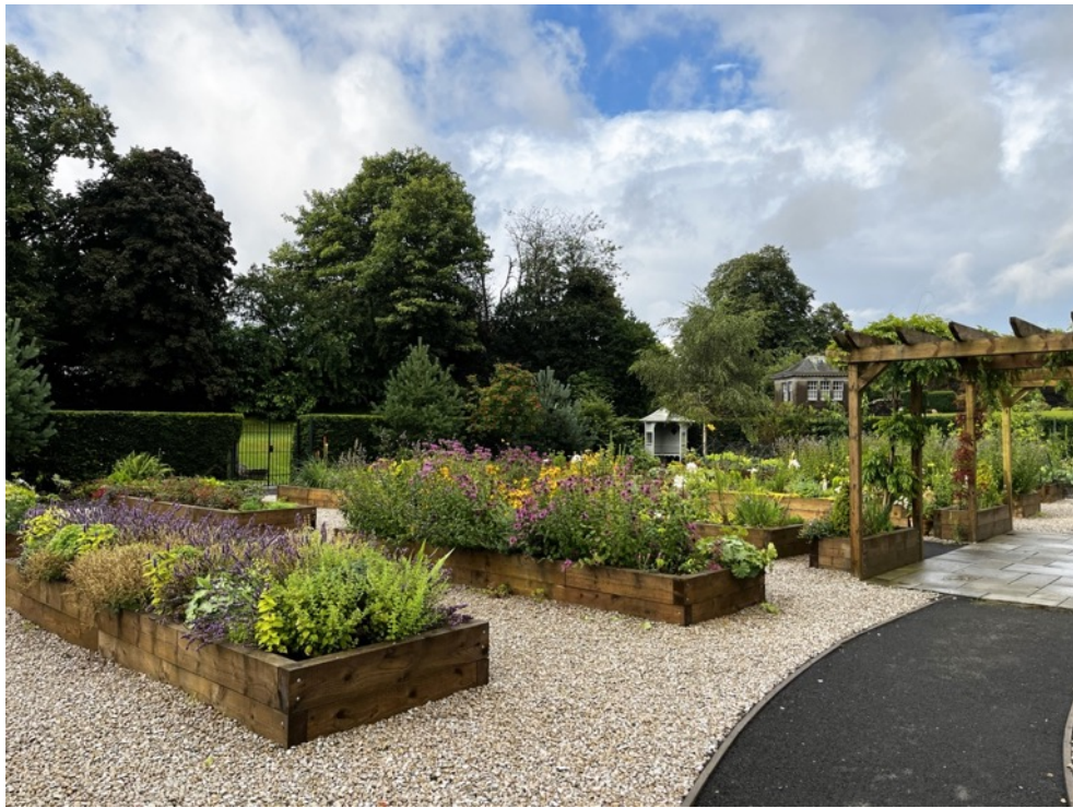
Gleneagle's resort in Scotland shows off a versatile display utilizing raised beds. Grasses and weeds from the adjacent areas are also less likely to creep into your boxed beds.

Think of a raised bed as a box that's open on top and bottom. Sitting on top of the soil allows the plants in the raised bed to access water and nutrients from the soil below. Once again your intention for planting will guide you towards the types of materials that you would use in constructing a raised bed. For example, if you are planting food crops, you would want to stay away from treated lumber that could potentially leach dangerous chemicals into the soil in which