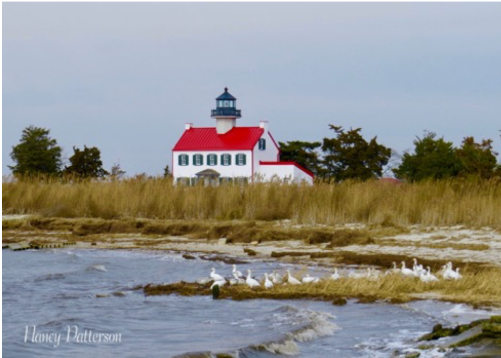
A flock of snow geese congregate on the NJ Delaware Bayfront at East Point Lighthouse, which is operated by the Maurice River Historical Society.