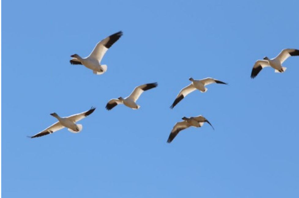
A group of show geese set their wings to land on the Cohansey River.

The region's premiere locations for waterfowl remain Edwin B. Forsythe and the Cape May State Park; if you get to the park, Lake Lily is right around corner. Should you need binoculars or a scope stop in NJ Audubon's Northwood Center, the "candy shop" for all your birding needs.