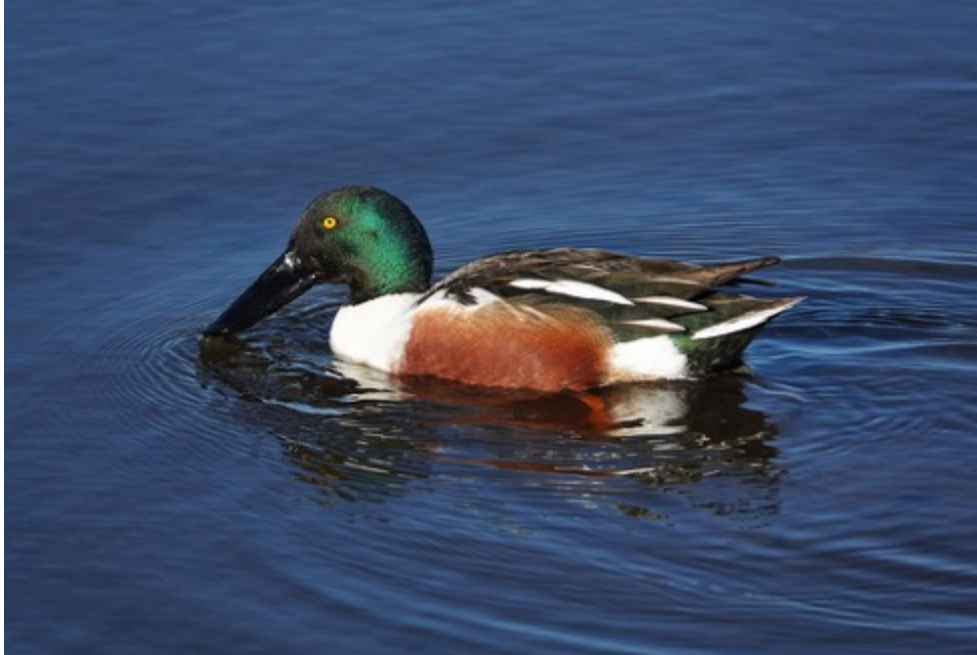
The gigantic bill of the northern shoveler is unmistakable.

Not every viewing spot is a bonanza, but those that I always check out in Downe Township include the pond near the fire hall in Dividing Creek, on Church Road / Route 555; here the waters flow to the town's namesake stream. The pond will often have courting hooded mergansers in February and March, a display that you won't want to miss. Two other spots where you may get lucky when mergansers are present are Dividing Creek and 553 near the Red-Eyed Crab Restaurant, or Nantuxent Creek in Newport, Downe Township, near the Bull on the Barn Restaurant – on Back Road/ Route 629. These three do not offer good pull-offs, so be sure to be mindful of traffic.