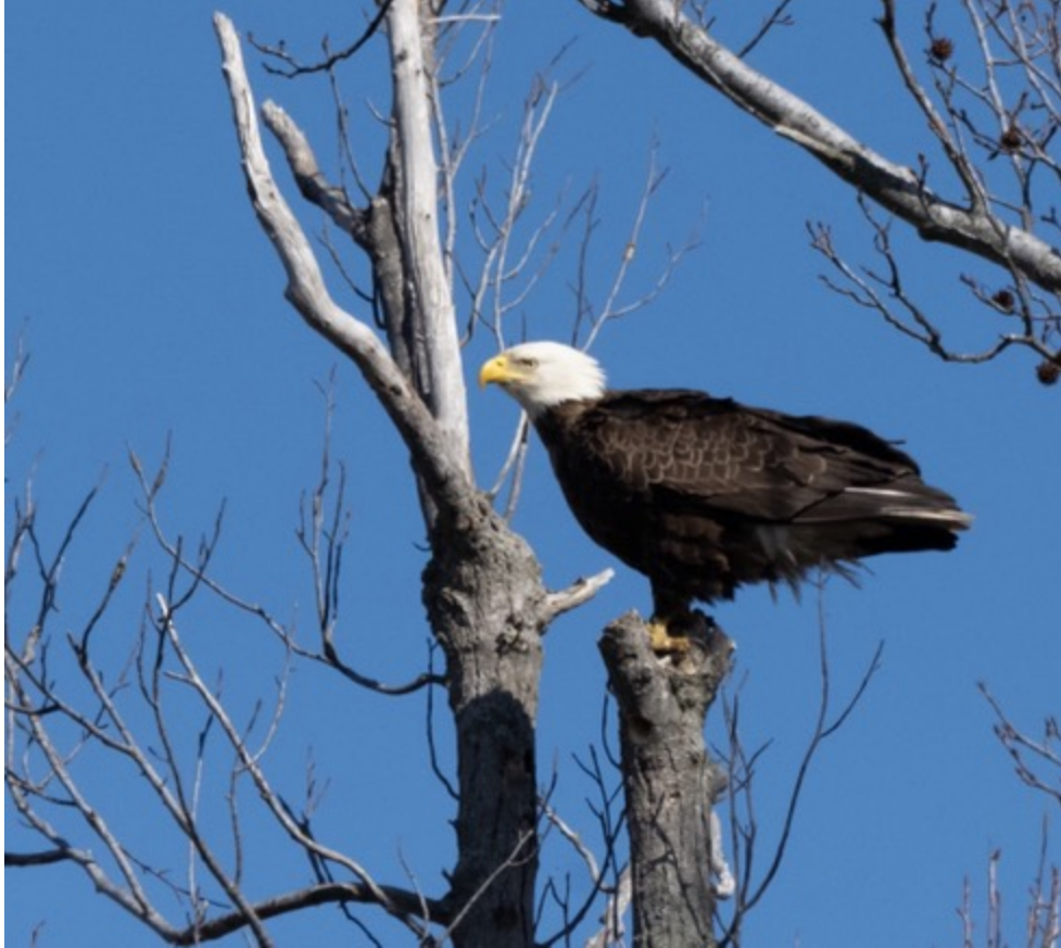
In the winter, eagle numbers increase along the New Jersey Delaware Bayshore.

Along the Bayshore, and in farm fields in Salem and western Cumberland Counties, keep an eye out for the showy flushes and flights of snow geese.