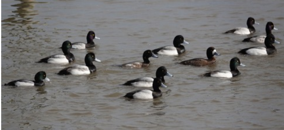
Scaup hang out at the bulkhead on the Maurice River waterfront.

On the other side of High Street, opposite the Bayshore Center in Bivalve, park at the end of Germantown Avenue and visit the PSEG restoration site via a paved path. You will want to take advantage of the elevated viewing boardwalk. If you have a telescope this is an opportune place to scan for ducks, snow geese, eagles, peregrine falcons, northern harriers, and possibly a wintering kingfisher. Ducks seen from this vantage point could include teal, pintail, black ducks, buffleheads, and others. The marsh is tidal and varying levels of water will produce different viewing opportunities. Don't forget to return to see the Bayshore Center in the spring, when they will be back in full swing, but you may also wish to attend the Second Friday celebration in December.