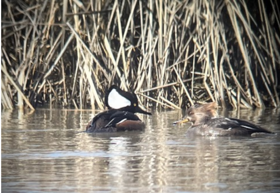
A hooded merganser displays for a prospective mate on Nantuxent Creek in Newport, Downe Township.

A great viewing area for buffleheads is along Maple Avenue in Dividing Creek where the impoundments are on either side of the road. Many people seasonally fish and crab here. All these roads are lightly travelled; however people who live in these areas are going about their daily affairs and may not appreciate your recreation interfering with their transportation needs. Be sure to seek a pull-over and again be mindful of traffic.