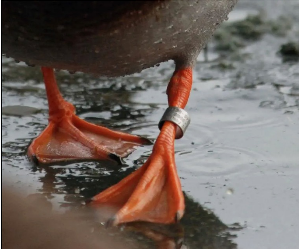
Banded duck; note the feathers repelling water and the webbing between the duck's toes and.

When the leg is pushed forward, the toes are held together to lessen resistance and get in place for the next stroke.