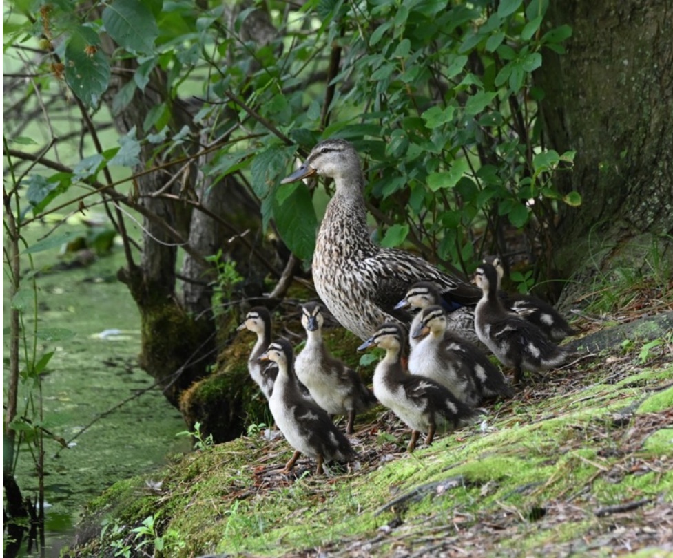
Mallard hen with brood. Chicks converse with one another while still in the egg.

How long do ducks live? According to the U.S. Geological Survey these are some of the oldest waterfowl reported by waterfowl hunters, based on recovered leg bands - mallard: 27 years, black duck: 26 years, blue-winged teal: 23 years, redhead: 23 years, wood duck: 23 years, northern pintail: 22 years, American wigeon: 21 months, ring-necked duck: 20 years, green-winged teal: 20 years (rounded to nearest year).