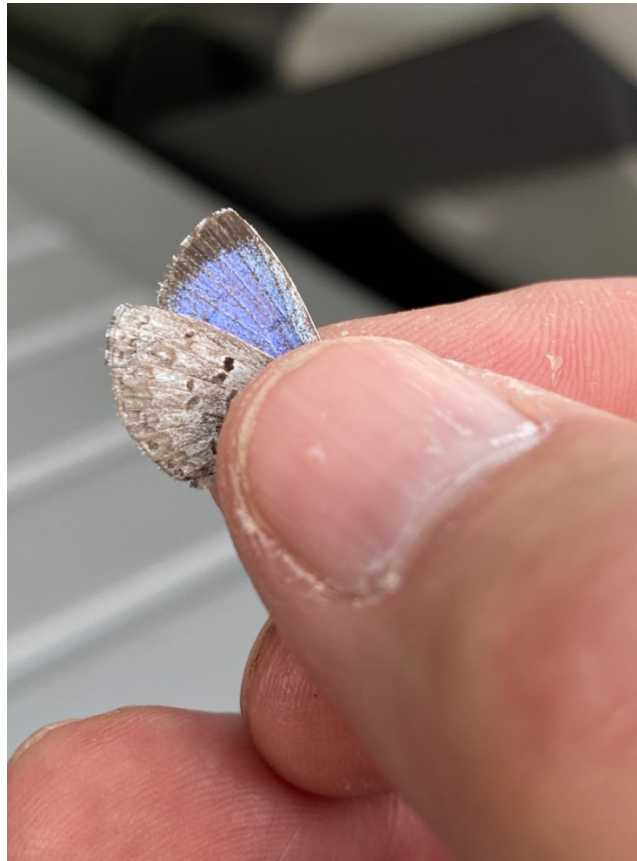
The spring azure is a thumbnail-sized butterfly.

Once they have emerged their priority is mating, which begins the whole circle of life again - the assurance of future generations. It is not unusual to see two azures flitting, about a foot off the ground, in courtship. These small butterflies live as adults for only a few days or weeks, so breeding is that much more urgent. Their underwing is camouflaged against leaf litter and when their wings are open you get a flash of blue, in a "Now you see me, now you don't" display of color. I often have trouble following these winged dancers.