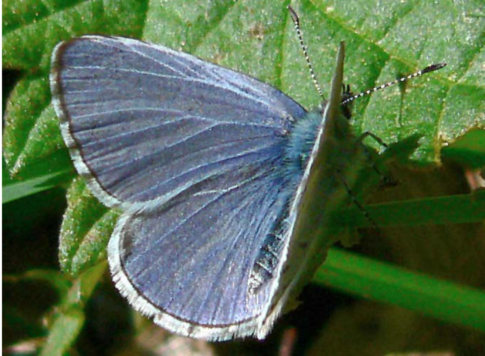
The azure is a lovely creature.