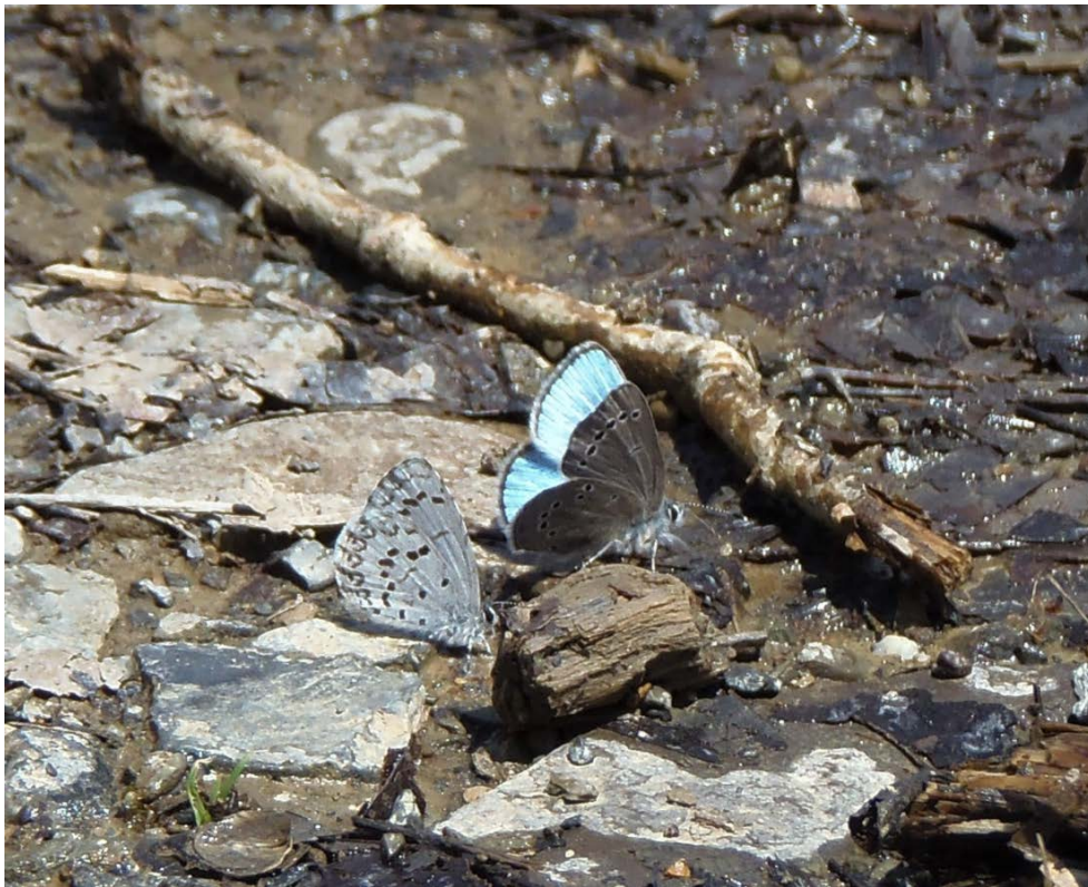
Puddling: Note the upper wing is displayed on the righthand butterfly. The closed-wing azure on the left is hard to distinguish from the background.

When they emerge in late winter or early spring, nectar is scarce. Spring azures get their nourishment from mineral sources, like mud puddles, rock surfaces, leaf litter, and even bird droppings.