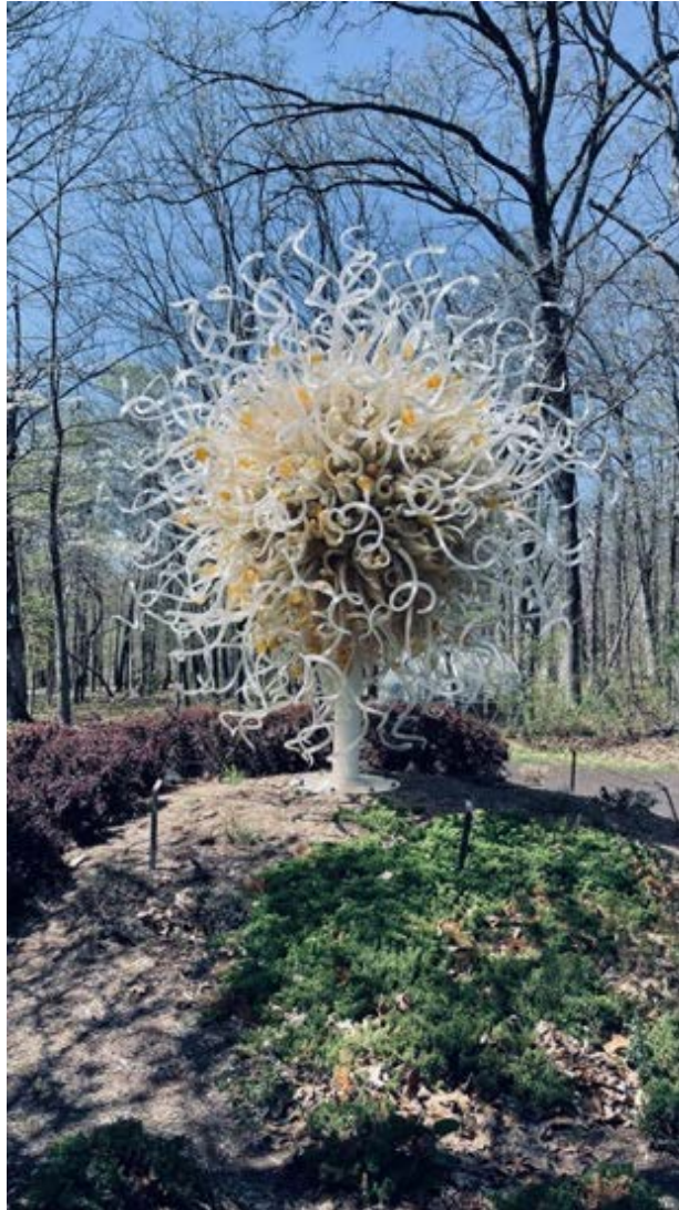
Dale Chihuly's Sculpture along the five miles of paths at the Crystal Bridges Museum of American Art.

She wrote letters to her son whom she sent to school in England. These span 1733 to 1748 and describe the political and social milieu of 18 th century New York along with the challenges of assimilation that affected Jewish families.