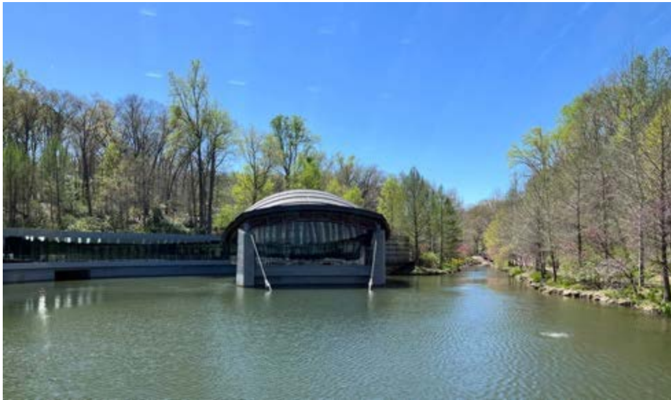
The museum is adjacent to and also spans over Town Branch Creek and springs.

Next week I will continue to share our travels – and some eclipse photos too.